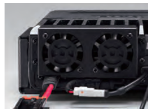
Optional CFU-F8100 fitted to the rear panel.