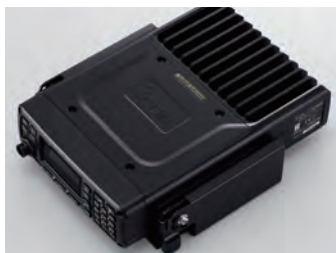
IC-F8101 with optional MB-126.

The IC-F8101 has a durable, enclosed structure securely sealed from the elements, in a stealthy black compact package. The IC-F8101