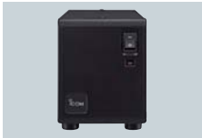
PS-126 DC POWER SUPPLY Compact power supply with high current capability. 13.8V DC, 25A max. 4-pin type. (For #21, #32 versions)