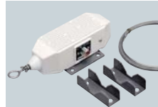
MN-100L ANTENNA MATCHER Match the transceiver to a long-wire antenna without applying DC power. 15 m×1 antenna wire comes attached.