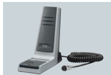
SM-27 DESKTOP MICROPHONE Dynamic microphone with PTT lock switch.