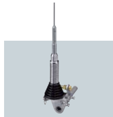
AH-2b ANTENNA ELEMENT For mobile operation with the AH-4. All bands between 7–30 MHz can be matched.