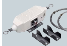
MN-100 ANTENNA MATCHER Match the transceiver to a dipole antenna without applying DC power. 8 m×2 antenna wires come attached.