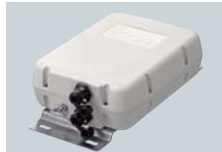
AH-4 AUTOMATIC ANTENNA TUNER Covers 3.5–30 MHz with a 7 m (23 ft) or longer wire antenna.