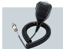
HM-219 HAND MICROPHONE Same as that supplied.