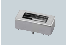
455 kHz FILTERS FL-53A CW narrow; 250kHz/-6 dB FL-222 SSB narrow; 1.8kHz/-6 dB FL-257 SSB wide; 3.3 kHz/-6 dB