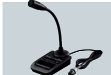
SM-30 DESKTOP MICROPHONE Compact, lightweight electret microphone.