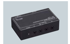
CT-17 CI-V LEVEL CONVERTER For remote transceiver control from a PC equipped with an RS-232C port.