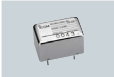
CR-338 HIGH STABILITY CRYSTAL UNIT Contains a temp. compensating heater for improved frequency stability. Frequency stability: ±0.5 ppm