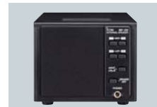
SP-23 EXTERNAL SPEAKER 4 audio filters; headphone jack. Input impedance: 8Ω Max. input power: 5W