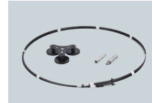
AH-5NV NVIS KIT Fiberglass mobile mounting antenna element for use with AH-740. Covers 2.2–30MHz (amateur band)