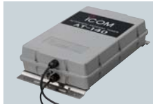
AT-140 HF AUTOMATIC ANTENNA TUNER Covers 1.6–30 MHz with a 7 m (23 ft) or longer wire antenna. AT-130/E is also available.