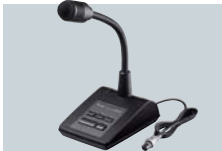
SM-50 DESKTOP MICROPHONE Dynamic microphone. Includes [UP]/[DOWN] switches and low cut function.