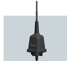
AH-740 AUTOMATIC TUNING ANTENNA Covers 2.5–30MHz (amateur band). OPC-2321 is required.