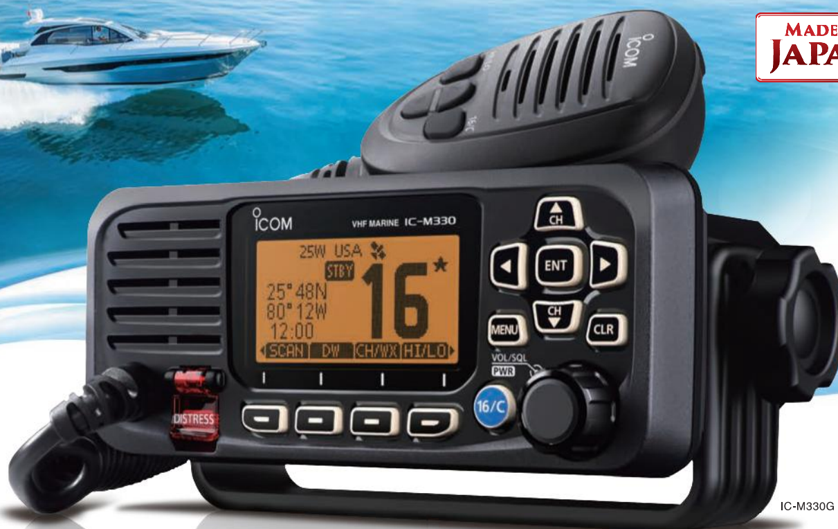
IC-M330G Black version