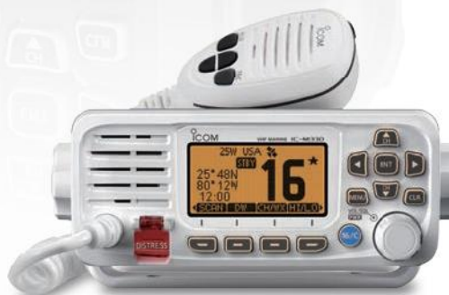
IC-M330G White version