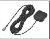
Supplied GPS antenna

A built-in GPS receiver provides your location, bearing and speed by using information from GPS, GLONASS and SBAS. The acquired position information can be used for DSC calls.